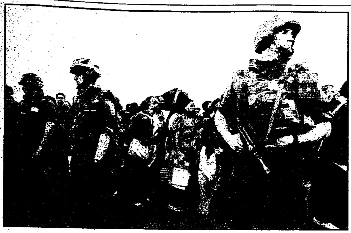
French troops protect French and Congolese nationals near Brazzaville airport yesterday.